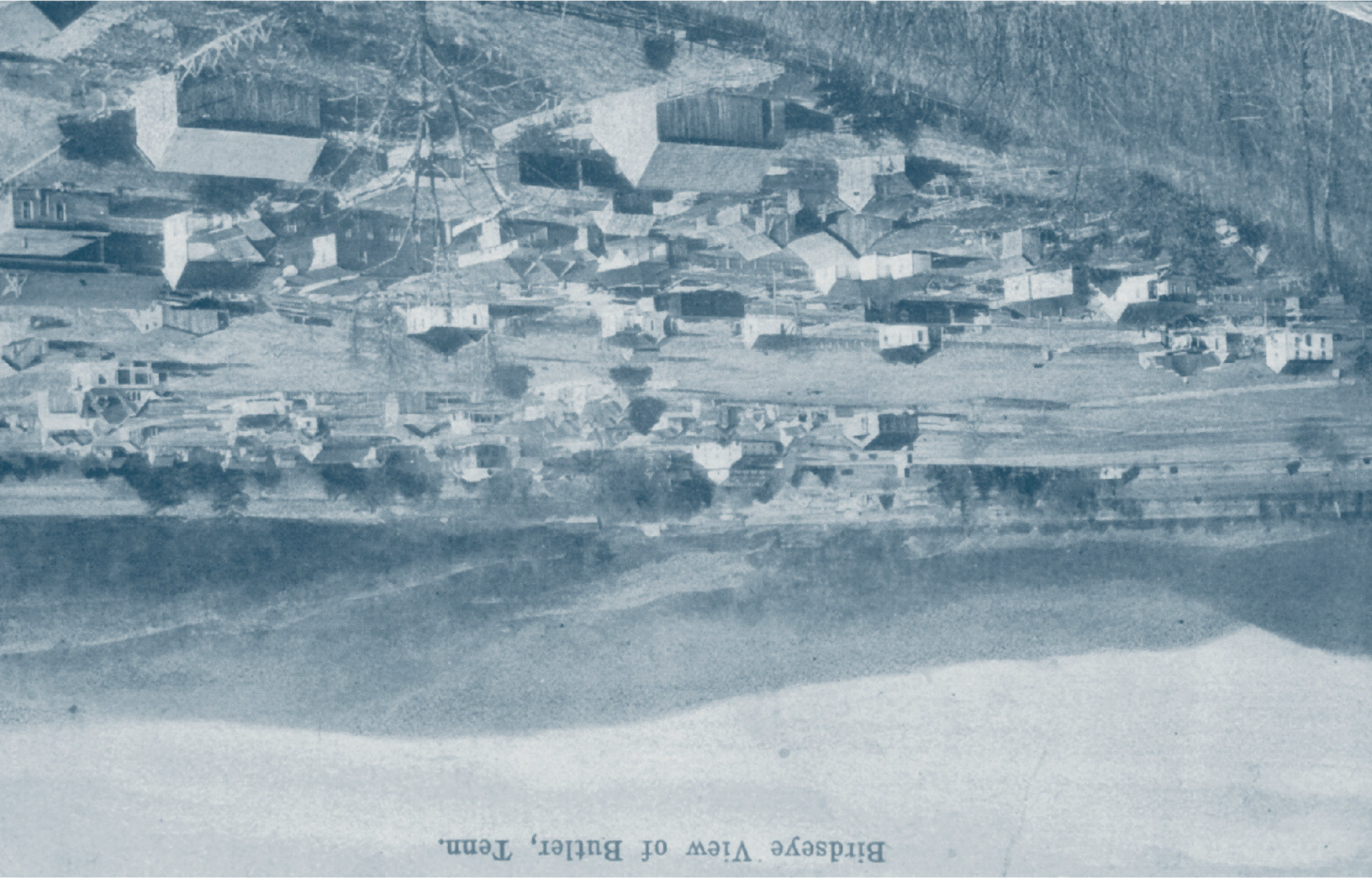
Birdseye View of Butler, Tenn.